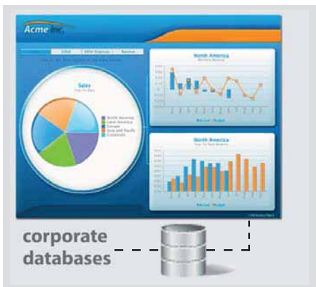
Figure 1: Sample Visual Model of Corporate Data

Xcelsius® Engage software allows you to create interactive dashboards from spreadsheets and live corporate data. It helps you predict future performance; save costs, time, and resources; extend the reach of your IT solutions; and maximize the value of your IT investments.